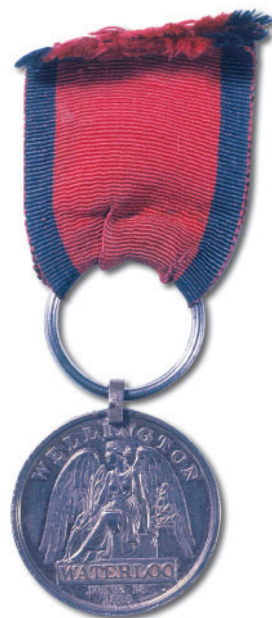
▲ British soldiers who fought at the battle of Waterloo received this medal.

Without doubt, Napoleon was a military genius and a brilliant administrator. Yet all his victories and other achievements must be measured against the millions of lives that were lost in his wars. The French writer Alexis de Tocqueville summed up Napoleon's character by saying, "He was as great as a man can be without virtue." Napoleon's defeat opened the door for the freed European countries to establish a new order.